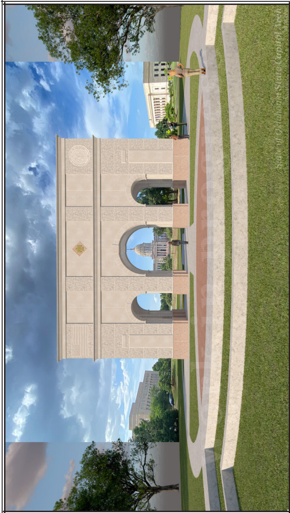
EXHIBIT E: Rendering of the State Capitol Arch